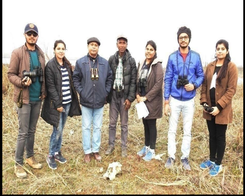
International Asian Waterbird Census 2020 in Hastinapur Wildlife Sanctuary by 21 October 2020 Department of Zoology