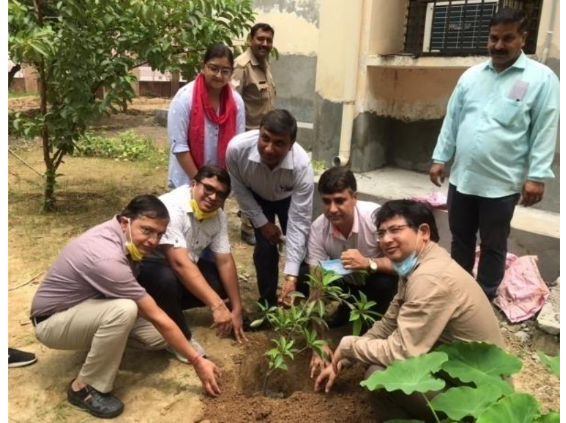
“Trees On, Global Warming Gone.” Plantation Drive Organized by Department of Physics, C.C.S. University, Meerut