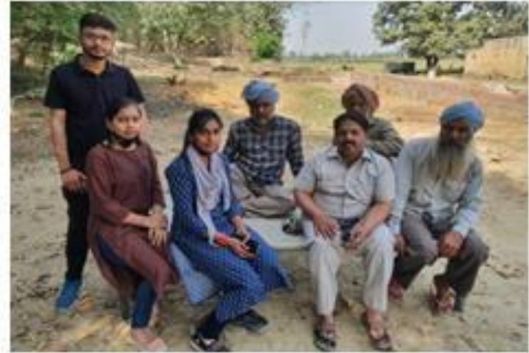
Man animal Conflict study in Hastinapur 25.12.20 (ongoing) Department of Zoology