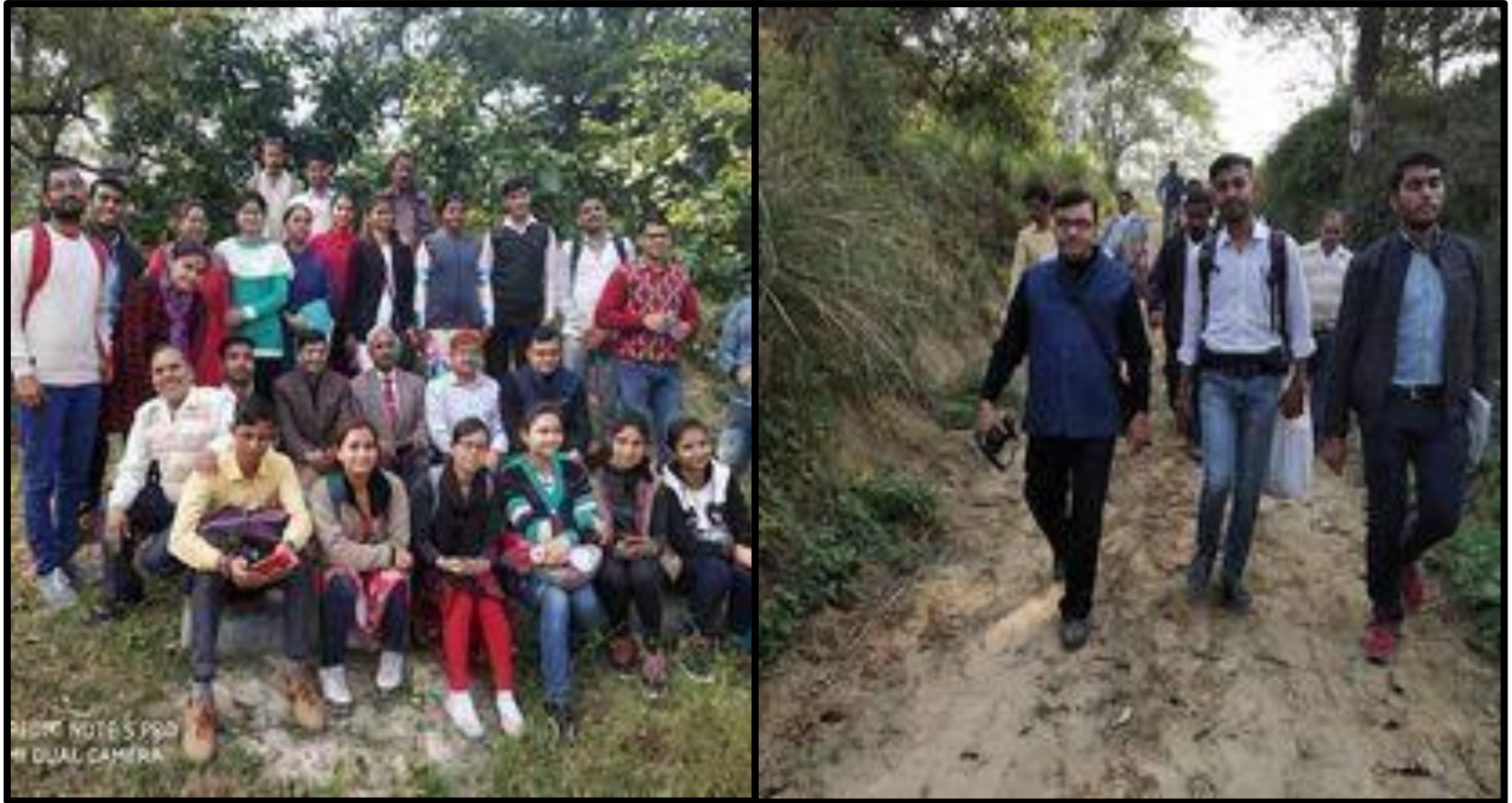
Hastinapur Wildlife Sanctuary: 04 March 2020 Department of Botany

Students visit this sanctuary in every academic year for collection of plants