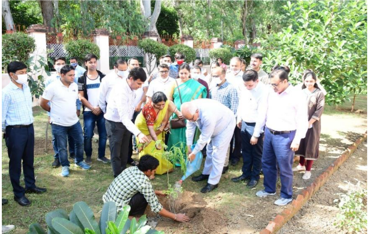
“Trees On, Global Warming Gone.” Plantation Drive Organized by Department of Physics, C.C.S. University, Meerut