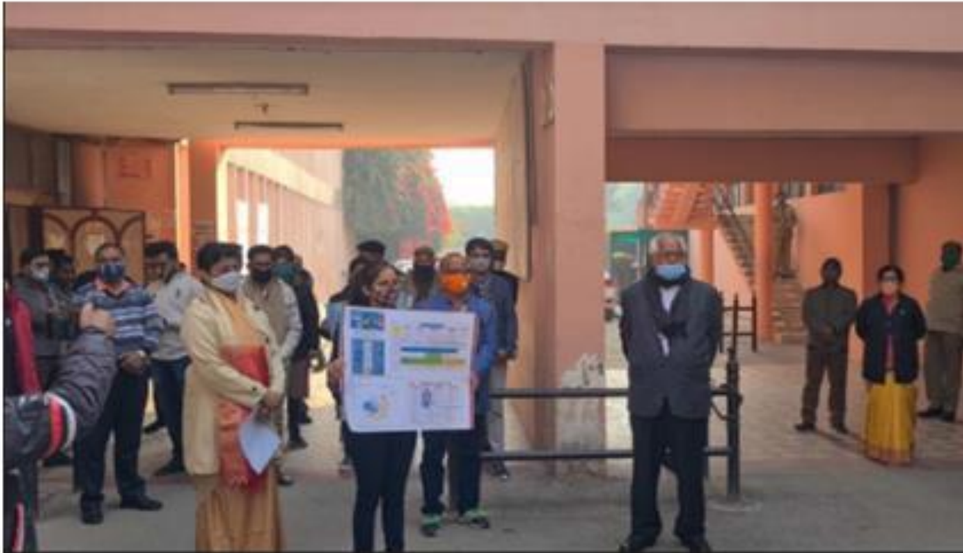
Campus drive by Eco club 23.12.20

Campus drive by Eco Club 23 December 2020 Department of Zoology