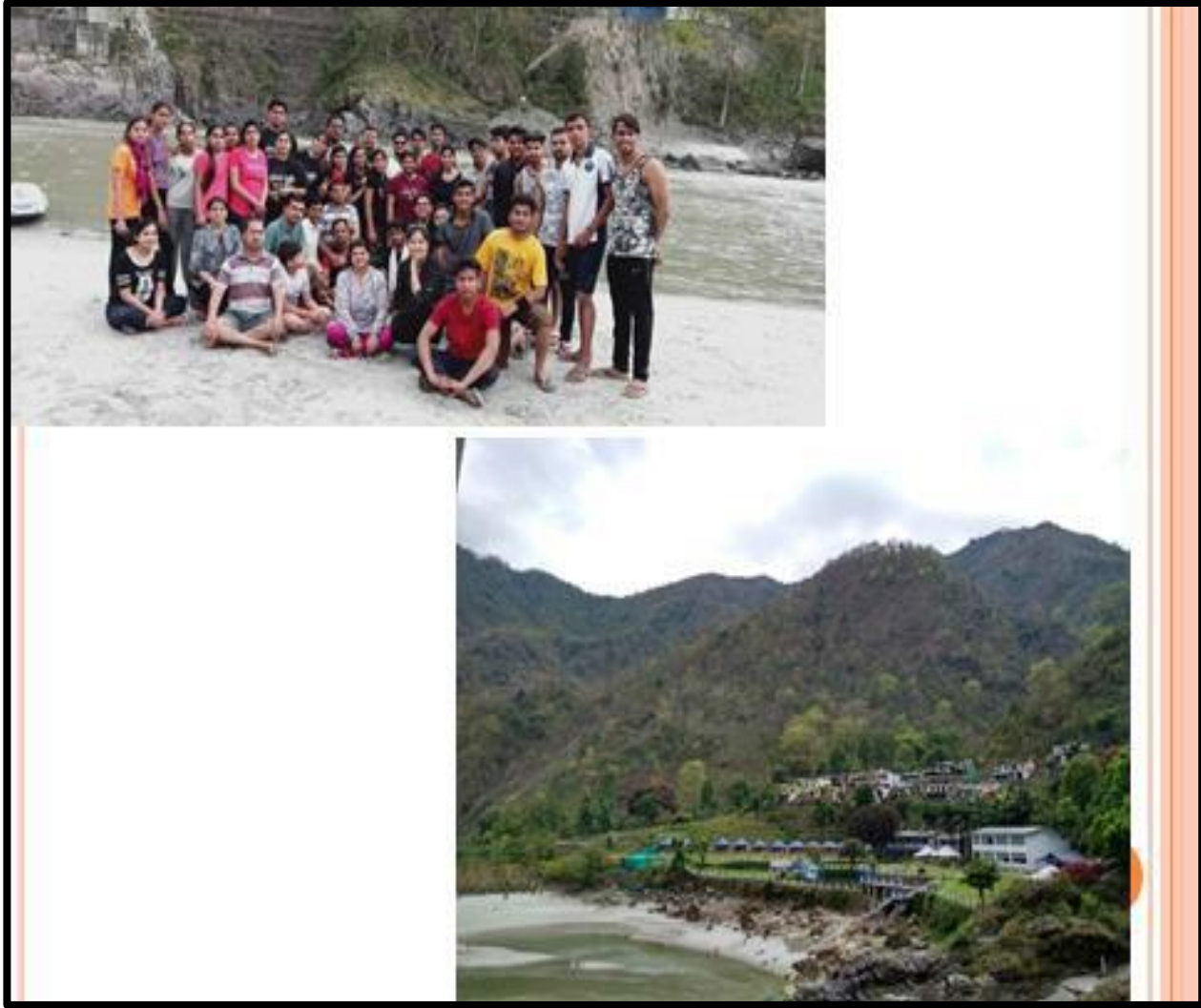
Awareness Programme on 'CLEAN GANGA' Visit to Rishikesh 20 April 2019 Department of Commerce