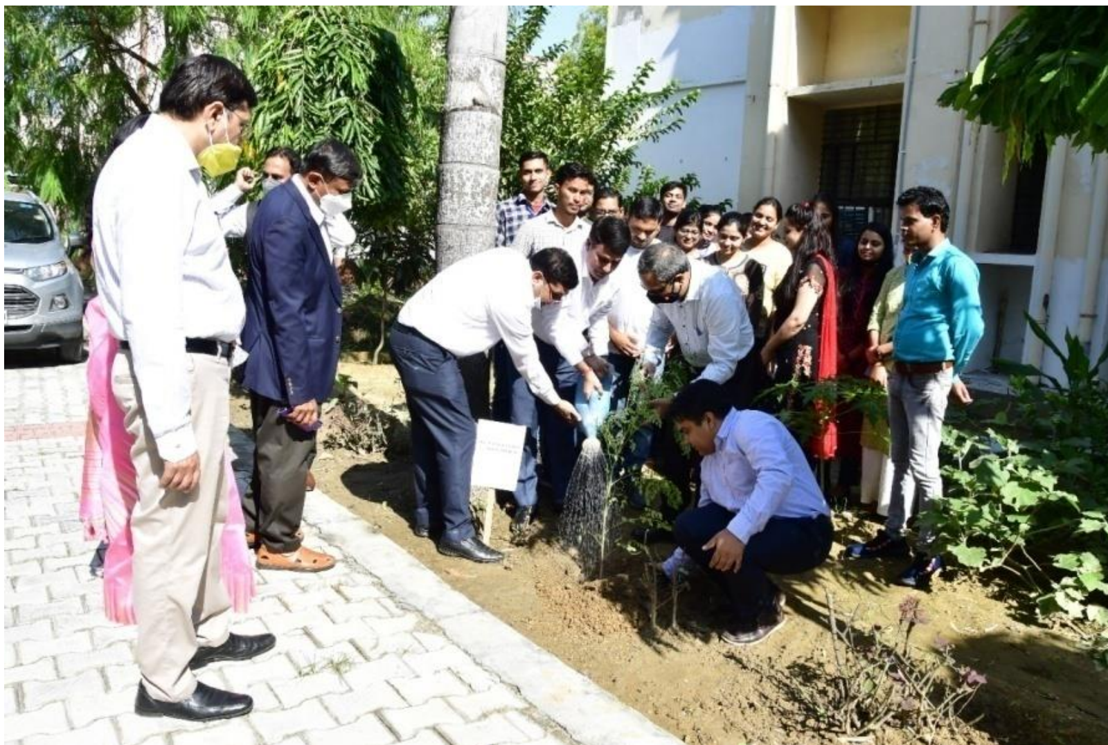
“Trees On, Global Warming Gone.” Plantation Drive Organized by Department of Physics, C.C.S. University, Meerut