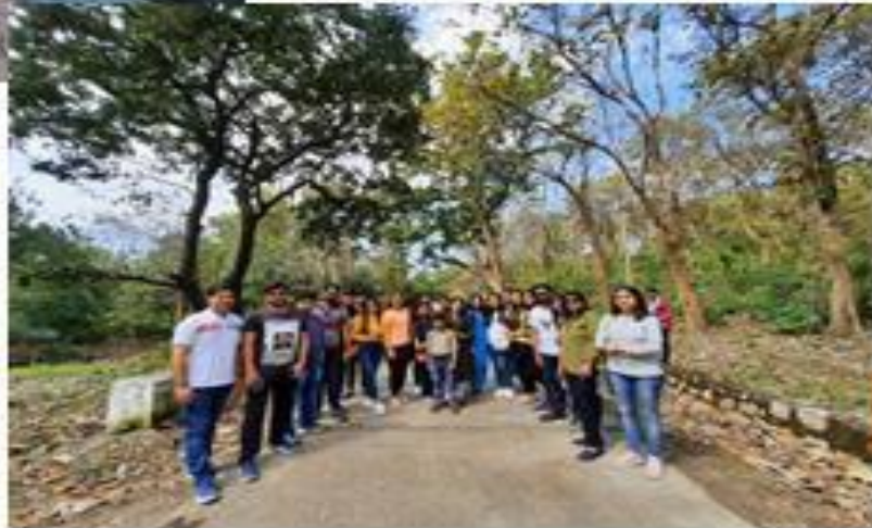
Environment Awareness Programme Visit to JIM CORBETT NATIONAL PARK 12- 13th March 2020 Department of Commerce