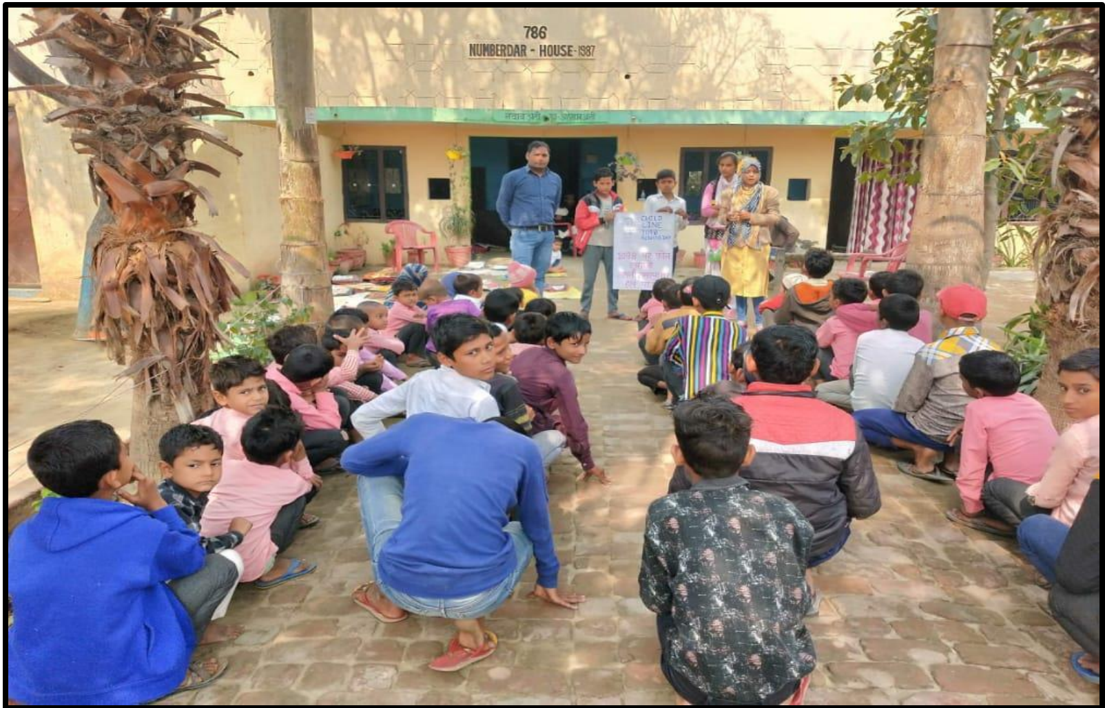
World Environment Day 5 June 2021 Department of Sociology