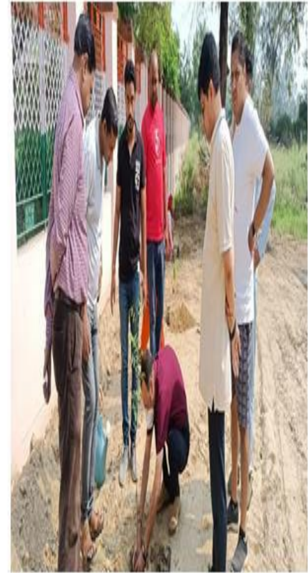
Plantation Drive 25 December 2020 Department of Horticulture