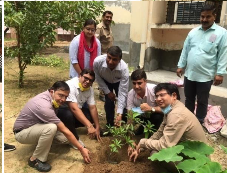
“Trees On, Global Warming Gone.” Plantation Drive Organized by Department of Physics, C.C.S. University, Meerut