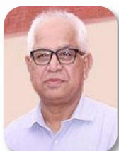
Prof. N.K Taneja

Implementation of NEP-2020 in the session 2021-2022