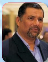
Guest of Honour